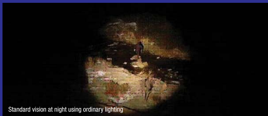
Standard vision at night using ordinary lighting

With the approval of the Civil Aviation Authority under Part 141, the Auckland Rescue Helicopter Trust is now conducting an industry first by carrying out its own NVG re-currency programme, requiring pilots and crews to undergo ground and flight training.