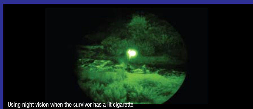
Using night vision when the survivor has a lit cigarette