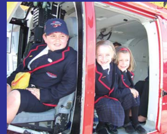
Sunderland School pupils raised over $7500 for the Trust with their sponsored fitness test challenge.

The dedication, generosity and goodwill that goes into these fundraising events is a source of inspiration and a very humbling experience for staff at the Auckland Rescue Helicopter Trust.