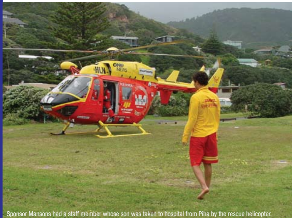
Sponsor Mansons had a staff member whose son was taken to hospital from Piha by the rescue helicopter.