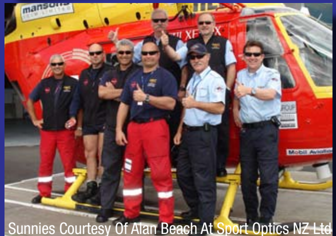
Sunnies Courtesy Of Alan Beach At Sport Optics NZ Ltd